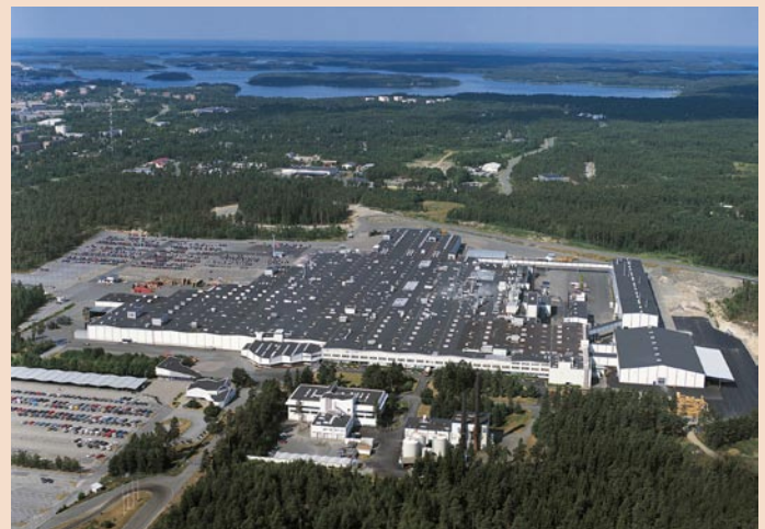
Picture 2. Valmet Automotive, Uusikaupunki plant

Wonderware MES solution for Valmet Automotive production was completed in three months in summer 2009. The fast project development and implementation of the MES solution assisted Valmet Automotive in its efforts to adjust production processes to the changed markets and customer needs.