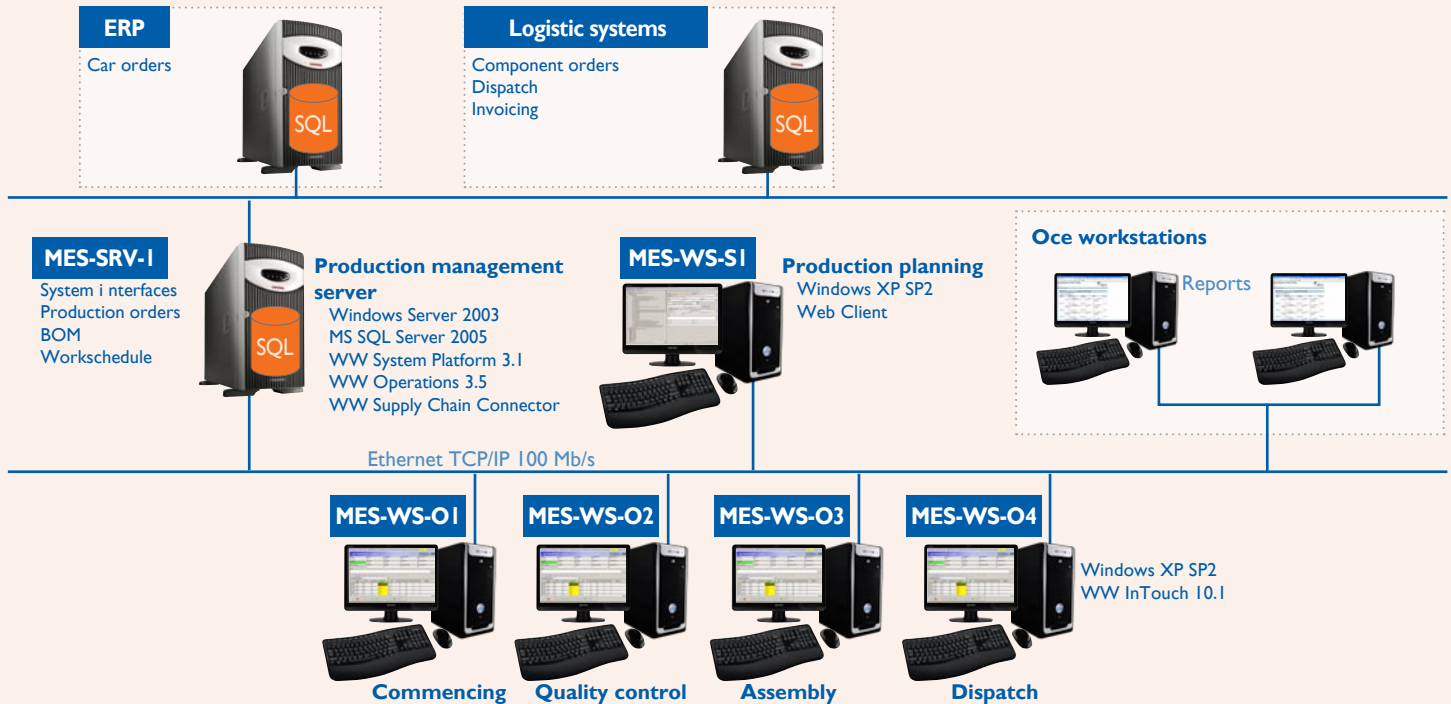
Picture 3 Valmet Automotive (Uusikaupunki). MES solution configuration