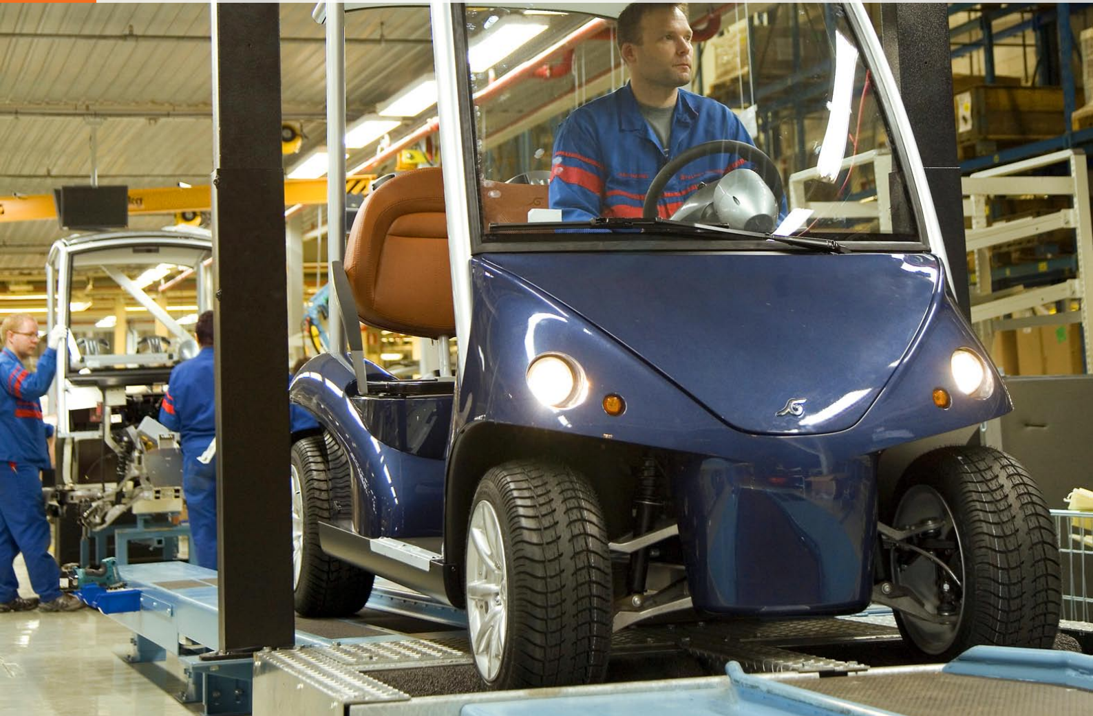
Picture 1 Valmet Automotive, Uusikaupunki plant